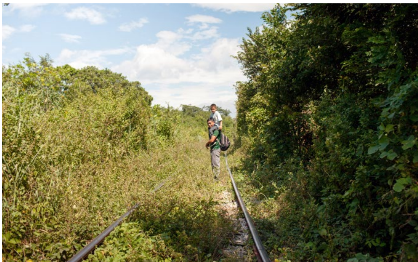
A man from El Salvador carries a child on the stretch that divides Arriaga (Chiapas) from Chautit (Oaxaca) on their way to United States, in Chiapas, Mexico. Photo © UNHCR/Markel Redondo, October 2015

The DGME database is the main source of information on these men, women and children, shedding light on the displacement continuum from their perspective, and the situation they face once back in the country. One of its findings is that 40 per cent of deportees who fled El Salvador because of insecurity fear they cannot return to their communities of origin.