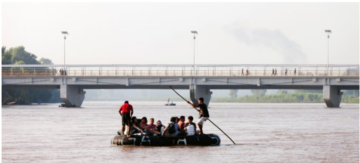
The Suchiate river is one of the main entry points northward for many Central American people escaping violence in their countries.

With no protection or assistance from the state, even for those who reported the crimes, all of the interviewees used personal connections and social networks to protect themselves and their families and flee the country. In some cases relatives living outside of El Salvador helped by paying their expenses and contracting smugglers, also known as coyotes.